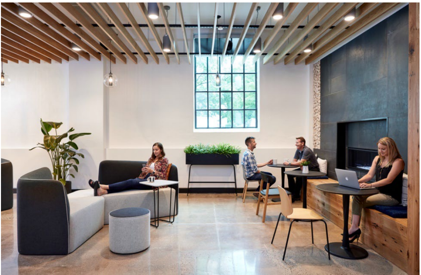
2000's – 2020