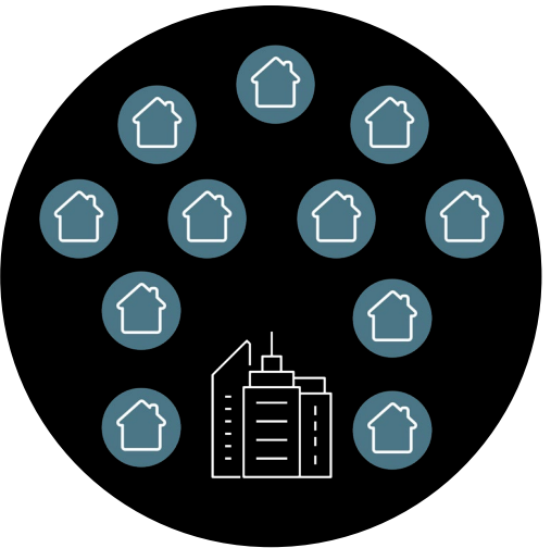
Central Hub Work From Anywhere