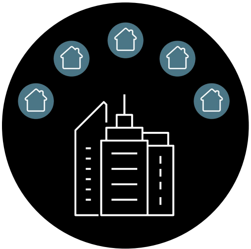
Exploring The New Normal 10% - 30% WFH