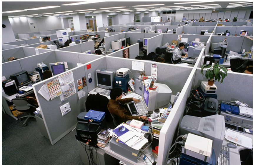
1980's – 2000's