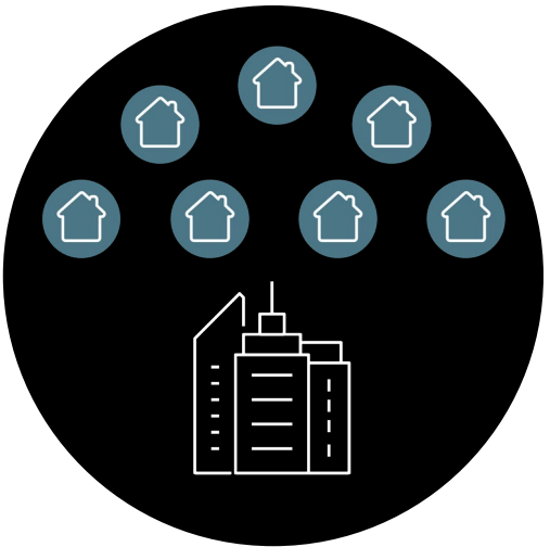
Workplace Is A Destination 30% - 50% WFH