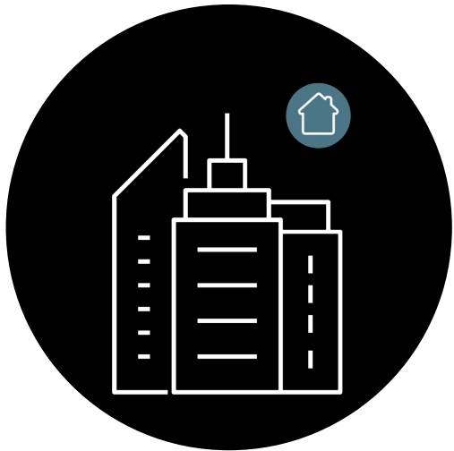
Business As Usual Limited WFH